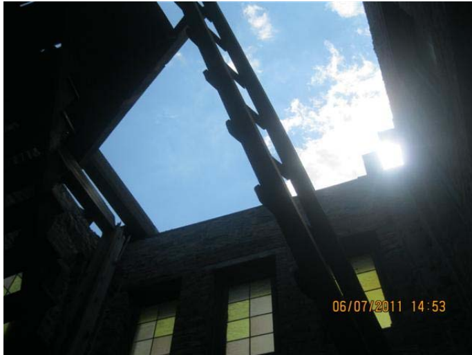
Photo # 3: Note falling ladders. These chase ladders led to steeple peak

Claim Number: 11013760 Our File Number: 1860073