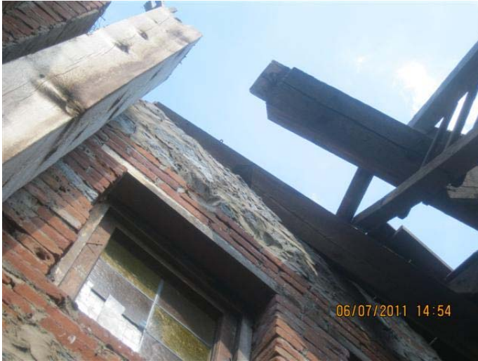
Photo #:7 Looking up from steeple access to where steeple existed prior

Claim Number: 11013760 Our File Number: 1860073