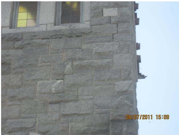
Photo # 24 Area blow steeple with stress cracks in block construction