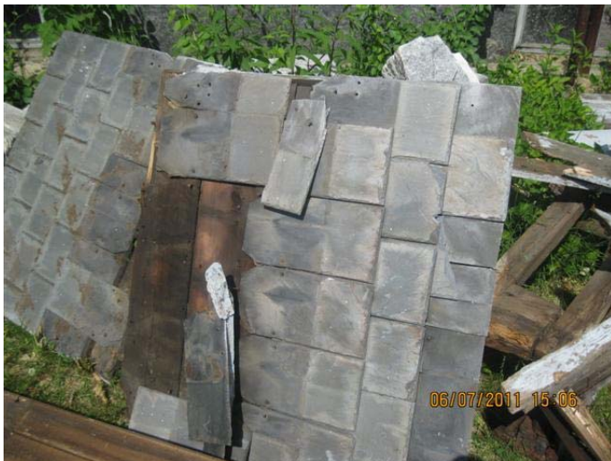
Photo # 16 Full panels of Slate roofing and sheathing from steeple