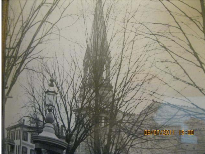
Photo #:11 Photo taken of picture of steeple as it existed prior to storm. Note the long arches leading to the steeple.

Claim Number: 11013760 Our File Number: 1860073