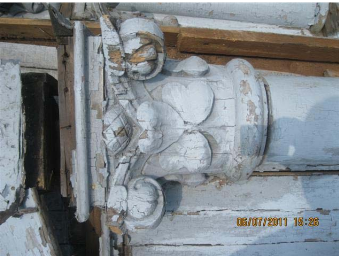
Photo # 20 Note decorative woodwork similar to that on the arches of the promenade