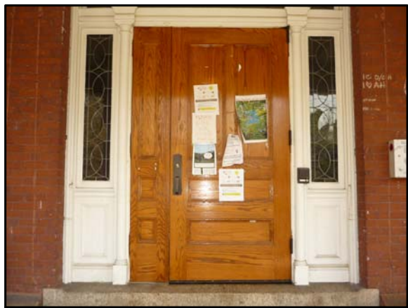
DOOR #1 FRONT