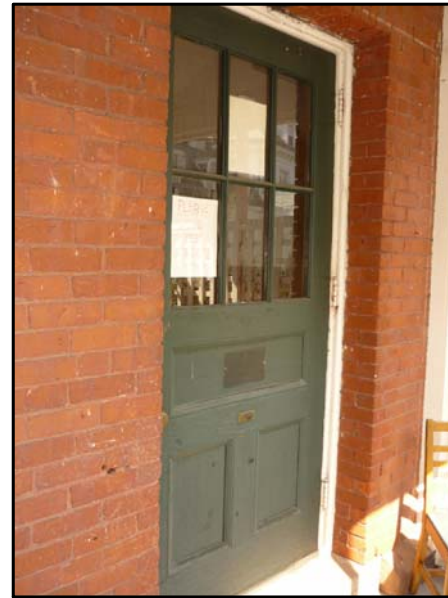
DOOR #2 SIDE