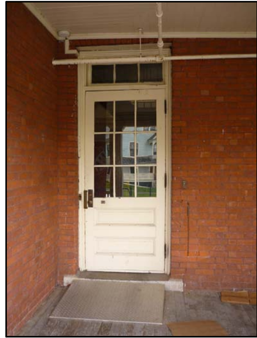
DOOR #2 BACKSIDE