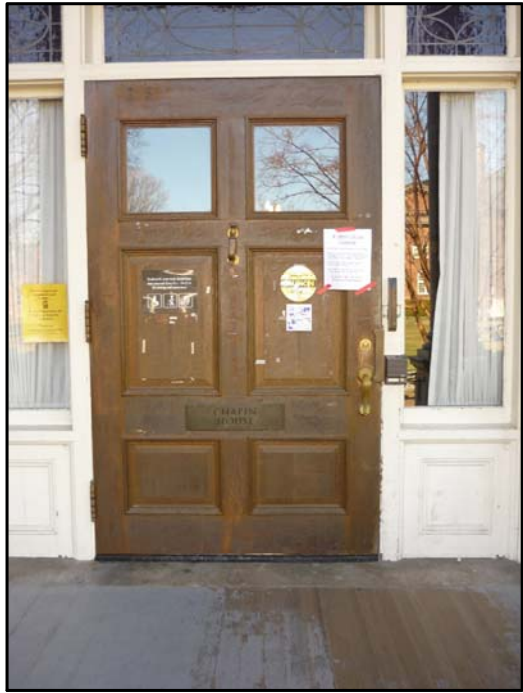
DOOR #1 FRONT