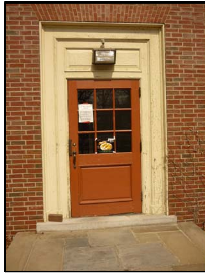
DOOR #3 SOUTH SIDE