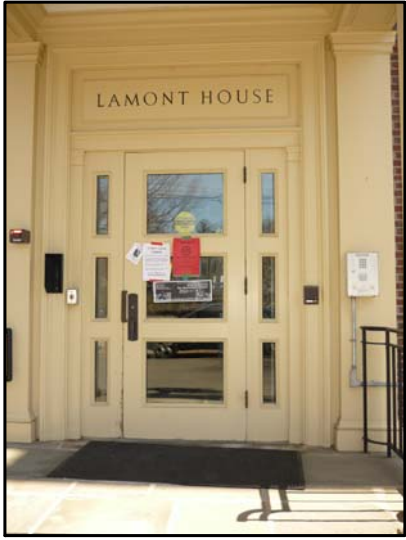
DOOR #1 FRONT