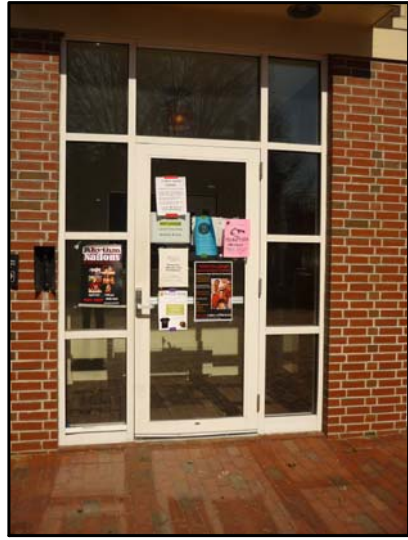
DOOR #2 DINING