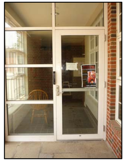
DOOR #4 DINING