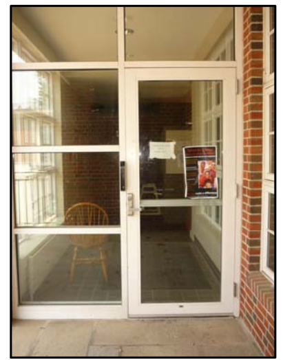
DOOR #4 DINING