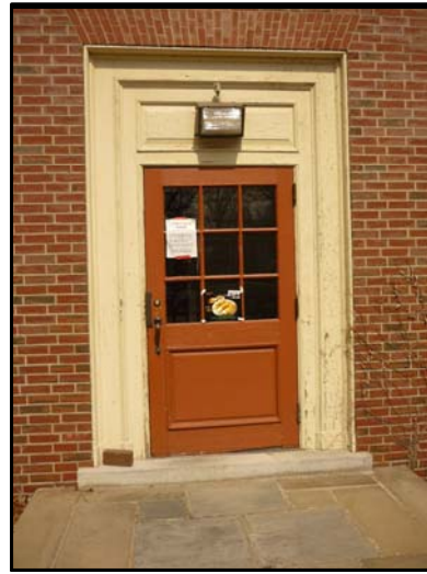
DOOR #3 SOUTH SIDE