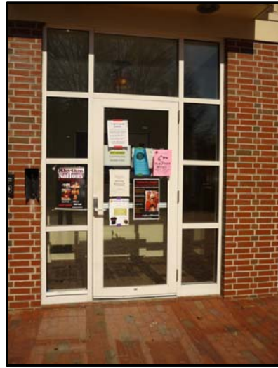
DOOR #2 DINING